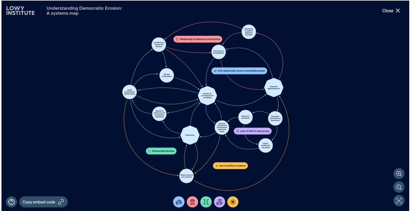
The interactive systems map

How do you use the map? The systems map illustrates the pathways and self-reinforcing loops, the circular chains of cause and effect, that accelerate democratic erosion. Some of these reinforcing loops include anti-democratic actors consolidating power, the weakening of balancing institutions, entrenched divisions, the loss of public faith in democracy, and the use of political violence. Users will see that by selecting any given element on the map the other elements with which it is connected are highlighted as can be seen in the image below.