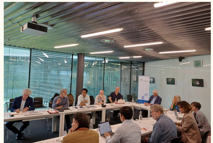
The Toda Peace Institute's working group of democracy researchers at a meeting in Geneva.